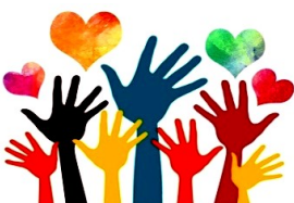
God's Work ~ Our Hands